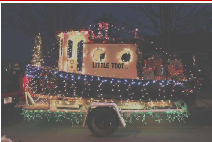
The staff was proud to tow Duane Chalk's Little Toot tugboat as the Museum's float in this year's Clayton Christmas Parade.