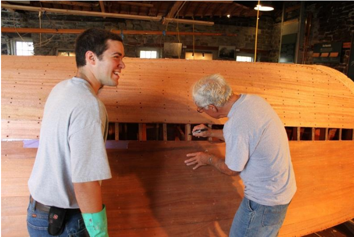
Before the plank went on everyone present signed the ribs for posterity.