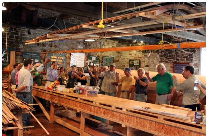
Boat Shop tradition is to toast the last plank with whiskey. Here museum staff and volunteers raise their glasses in celebration — and now you know what Wild Goose's Whiskey Plank means.