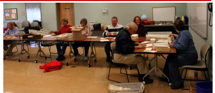
Many thanks to the volunteers who came in during the fall to help with the Thanksgiving Membership mailing.