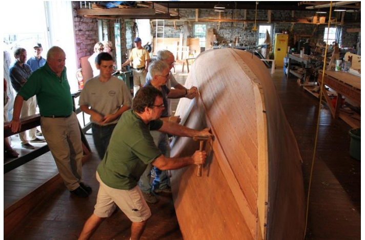
The last plank going on.